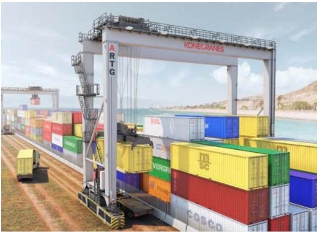
Konecranes' new ARTG version 2.0 cranes enhance safety and uptime.